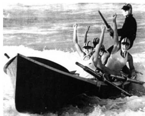
The Ladies Boat crew winning at the Australian Titles at Kurrawa 1997.